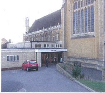
Ealing Abbey Parish Centre